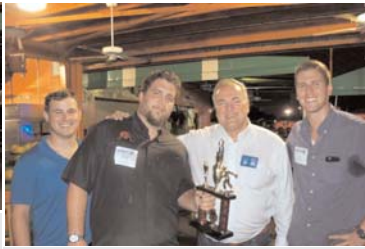
2nd Place Cornhole Toss Team - Glenewinkel Construction Co.