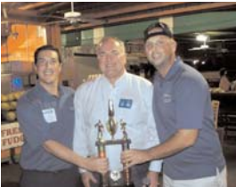
1st Place Cornhole Toss Team - Enterprise Fleet Management

Bob Roth's Groves, Davie Wednesday, October 7