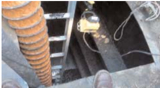
Ventilation hoses provide air and exhaust toxic vapors during confined space entry.

Confined spaces include, but are not limited to, tanks, vessels, silos, storage bins, hoppers, vaults, pits, man-holes, tunnels, equipment housings, ductwork, pipelines, etc.