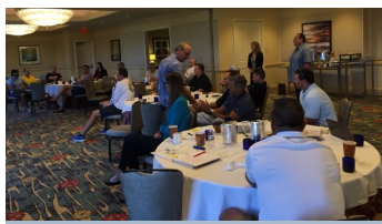
Members at the Ritz Carlton