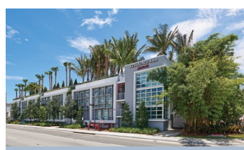
Surfside Residence Inn