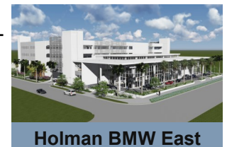
Holman BMW East

With a two-story showroom and attached five-level parking garage, the 283,430-square-foot project brings a strong, upscale design statement to a prime site just south of Downtown, at 1441 South Federal Highway. Opening is scheduled for spring 2017.