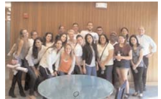
FIU Interior Architecture Plant Tour