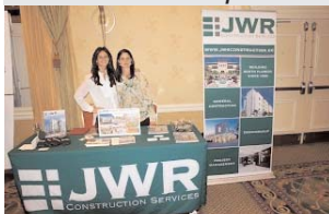
JWR Construction Services