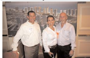
JMA of Florida