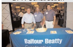
Balfour Beatty Construction