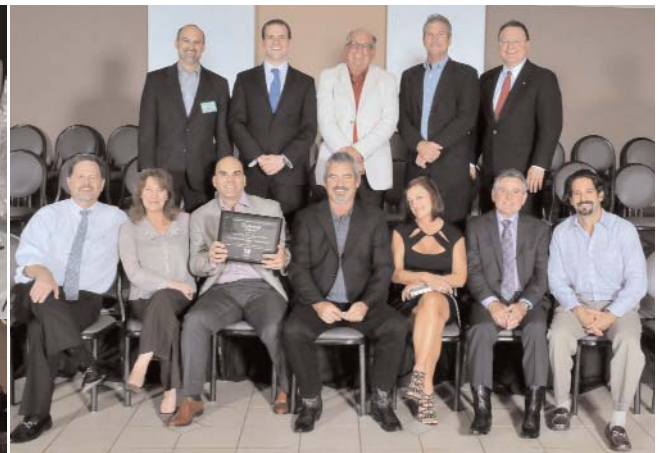
Stiles Construction Team who worked on Centurion Air Cargo Facility, the 2013 Overall Craftsmanship Award Winner, along with Stiles Architectural Group and MER Engineers for Aero Miami III, LLC.