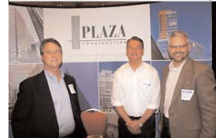
Plaza Construction FL