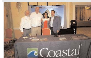
Coastal Construction Group