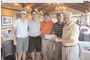
2nd Place South Course Baker Concrete Construction