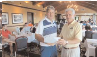
3rd Place North Course Northwestern Mutual