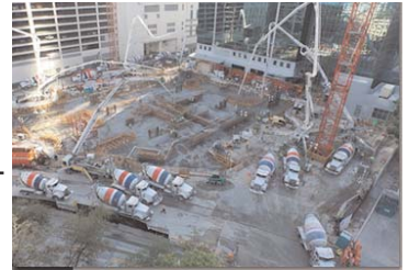
Panorama Tower 23-hour Concrete Pour

June 2015 Vol. 26, No. 06 Ft. Lauderdale, Florida