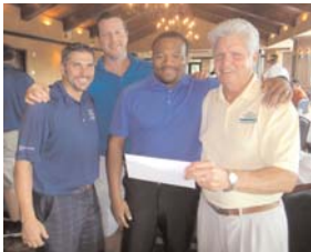
1st Place South Course Suffolk Construction