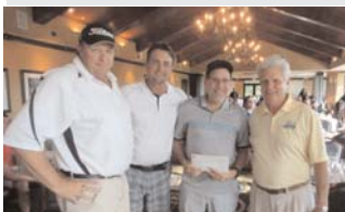
3rd Place South Course Thermal Concepts