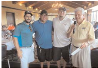
1st Place North Course East Coast Metal Decks