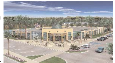
USCIS in Royal Palm Beach