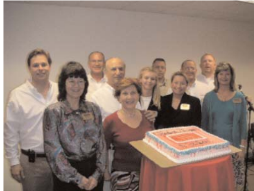
Celebrating their 25th Anniversary