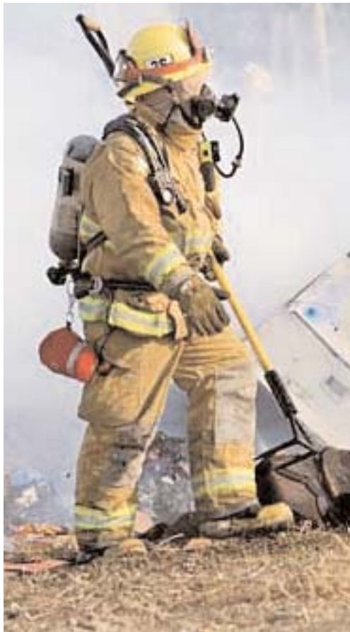
You don't want this guy showing up at your job!

prevention states: The employer shall be responsible for the development and maintenance of an effective fire protection and prevention program at the job site throughout all phases of the construction, repair, alteration, or demolition work. The employer shall ensure the availability of the fire